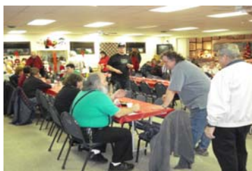
A friendly get together for the holidays