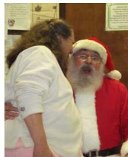
Santa with Mrs. Claus