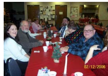
Enjoying the spirit of the holiday