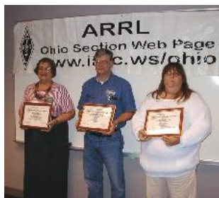
The top three winners in the newsletter contest :

Second place with 84 points- CQ- the newsletter for the Mount Vernon Amateur Radio Club