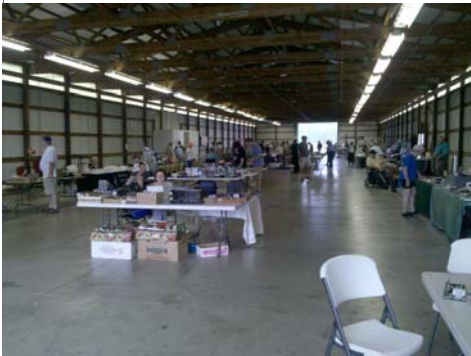
Inside vender area