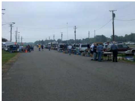
Outside Vender Area