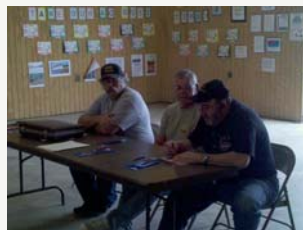
VE Testing Team