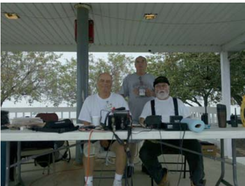
Mobile check in station and operators