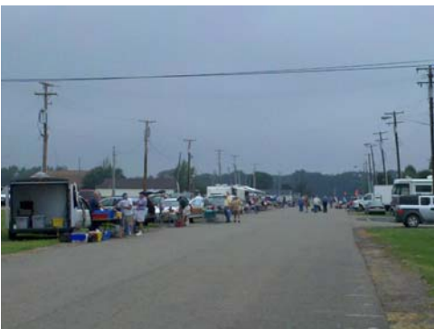
Outside Vender Area