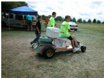
Boy scouts having some fun after our hamfest