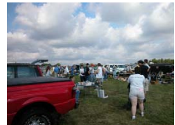
View of our hamfest flea market area