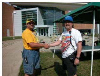
Youth scanner winner with KC8VYS