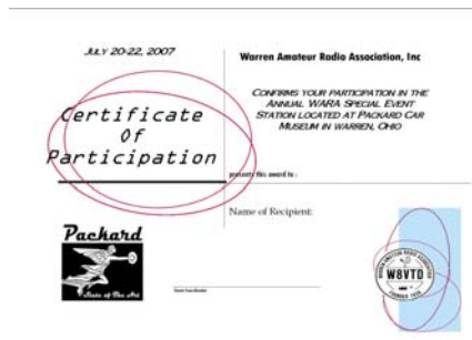
2007 Packard Certificate for Contacts