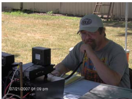
KD8FVH working from his dad's radio