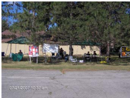
At our usual spot under the trees