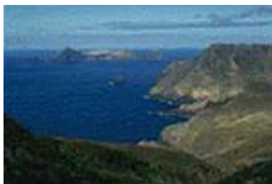
View from Selkirk look

Frequently history is stranger than fiction and none more so than in the tale of Alexander Selkirk: the